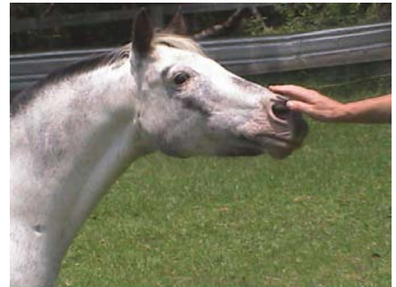
Thunder learning to trust

We are excited to announce the next step in business development – a website! We will be able to upload pictures of you all in action, current & past newsletters, details of clinics coming up, horses available for (half) lease/sale etc etc